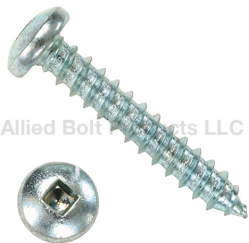
Allied Bolt Products LLC