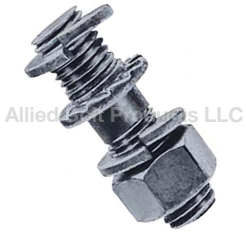
Allied Bolt Products LLC