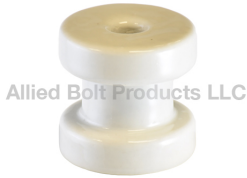
Allied Bolt Products LLC