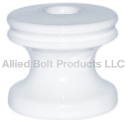
Allied Bolt Products LLC