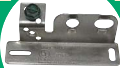
0 splices 1 ground screw